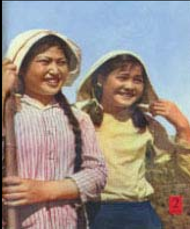
Women of China magazine 1966

educated youth in countryside – which is city girl?