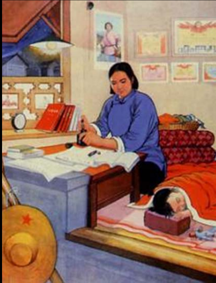
Zhao Chune 1935-82 Model Worker