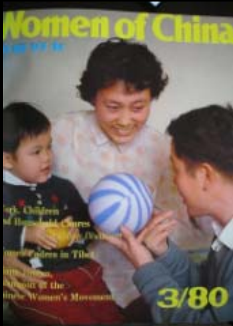
Women of China 1980